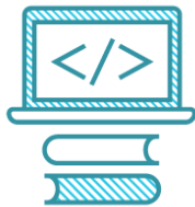
Full Stack Web Development